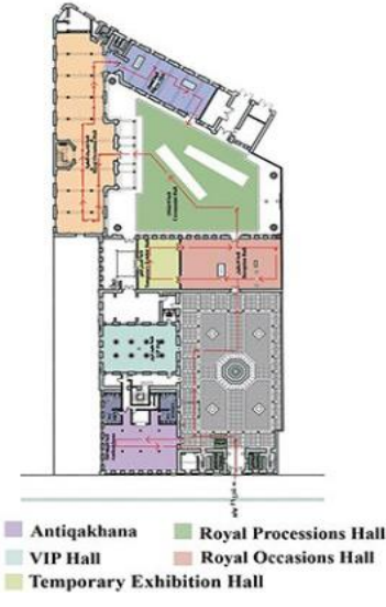
Figure 2. Plan of the Royal Carriages Museum [20]

The Royal Carriages Museum is one of the oldest specialized museums in the world. It is located in the Boulaq area and was opened after its development in 2020. It houses the royal carriages dating back to the era of Muhammad Ali Dynasty. The museum also contains horse crews and their supplies, as well as the clothes of the workers, in addition to a collection of oil paintings of kings and queens of this period [5]. Figure 2 Plan of the Royal Carriages Museum.