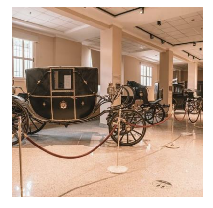
Figure 3. Image showing markings on the floor to ensure social distancing of 1.5

measures that should be available in museums to adapt to times of epidemics.